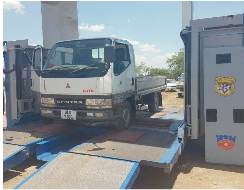
RTSA mechanised motor vehicle inspection equipment

A roadworthy test must be carried out every year on vehicles over five years old. Vehicle roadworthiness tests can be carried out by the RTSA and selected local authorities. Failure to comply, or losing proof that the examinations have been carried out, may result in a fine of K300.00. It is the car owner's responsibility to make sure that the vehicle is tested when it is due. For motor vehicles or trailers whose road worthiness test has been established as qualifying, disks are issued indicating the validity of the vehicle roadworthiness test.