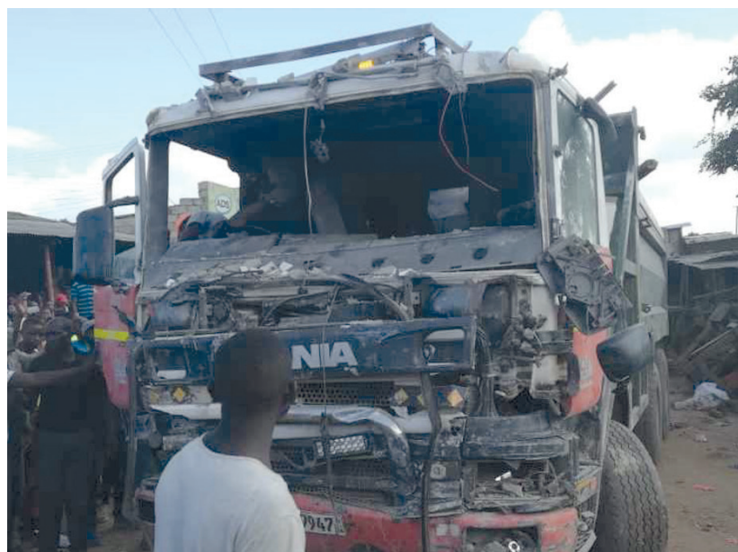
Ten-Miles road traffic accident in which five people died and 12 sustained serious injuries was caused by driver negligence and mechanical failure.

All roadworthy tests cost K48.80 regardless of size or make of the vehicle. To find the nearest RTSA test centre and selected local authorities call the