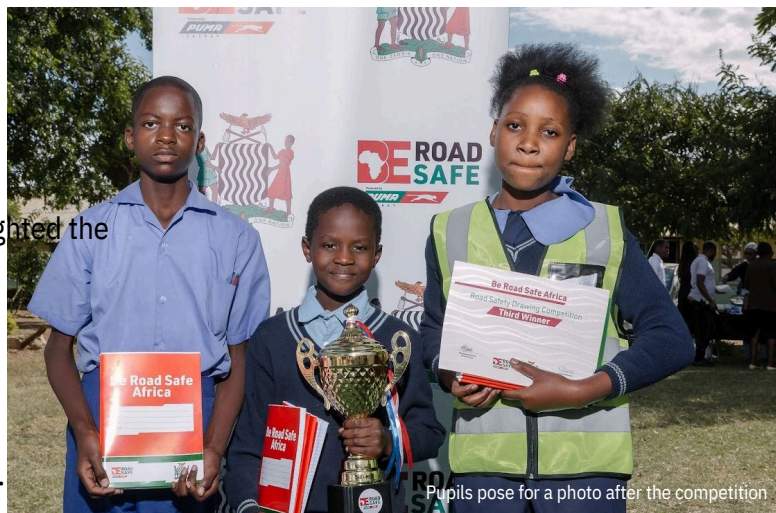
Pupils pose for a photo after the competition