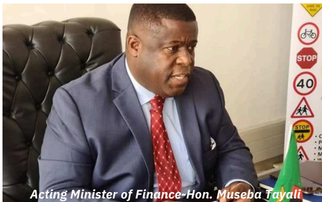
Acting Minister of Finance-Hon. Museba Tayali